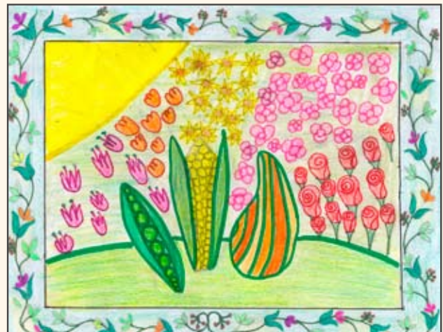
2006 Harvest Fair Scavenger Hunt Art Contest Winning Submission Kaia'tahen:te Arquette-Cross

Don't forget to weed, water and mulch your garden to grow healthy plants all summer long. Go to the Environment Office to use their resources. They have plenty of information on gardening (and composting too.)