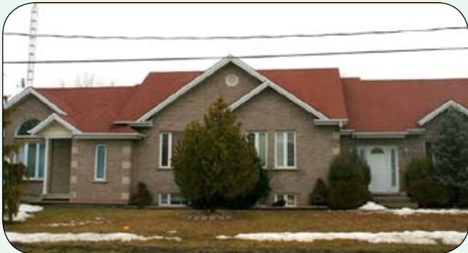
The Duplexes will use a design similar to these units.

There are 14 duplexes planned for construction, making 28 units available for purchase. They will be built in the new development of lot 106, past the Clay Mountains. The units will be sold in the mid $60,000 range, with zero down and mortgage payments comparable to those of the Kahnawá:ke multi-dwelling rental units.