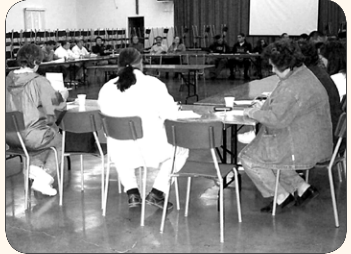
Community Meetings are currently not considered consultation in their present format