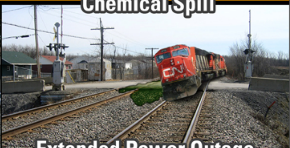
Extended Power Outage